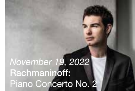
November 19, 2022 Rachmaninoff: Piano Concerto No. 2