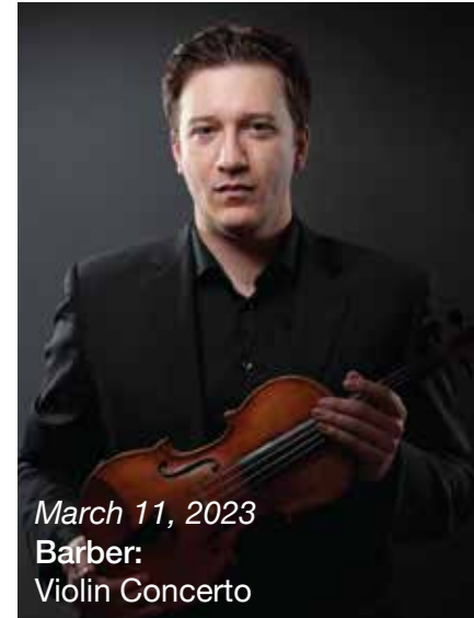
March 11, 2023 Barber: Violin Concerto