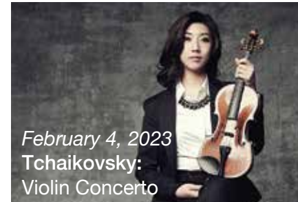
February 4, 2023 Tchaikovsky: Violin Concerto