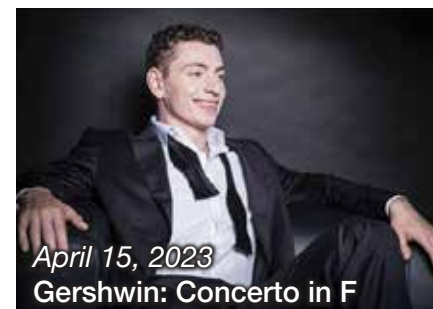
April 15, 2023 Gershwin: Concerto in F